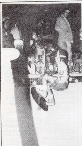
UNIDENTIFIED FLYING OBJECT We don't know who the skater is, but we liked the picture.

There were 114 trophies to be given out for 1st, 2nd & 3rd places.