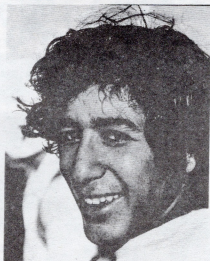
Ask for his EL GATO MODEL